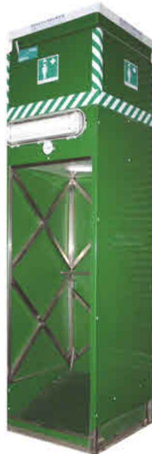
< GFTS M

Important note: The framework, operating linkages and pipe work used in our Tank Showers are manufactured in corrosion resistant Stainless Steel. We do not use mild steel.